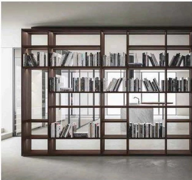
Boffi has expanded Antibes with a bookcase version of its bedroom storage. Visit: www.boffi.com