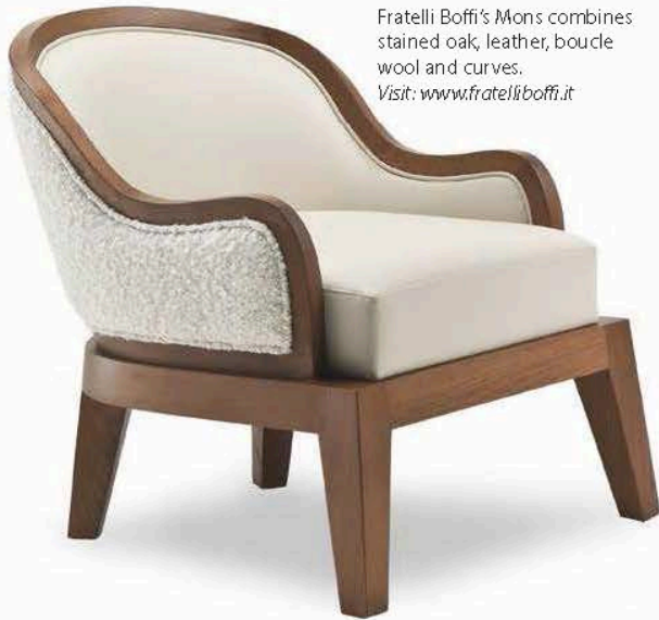
Fratelli Boffi's Mons combines stained oak, leather, boucle wool and curves. Visit: www.fratelli.boffi.it