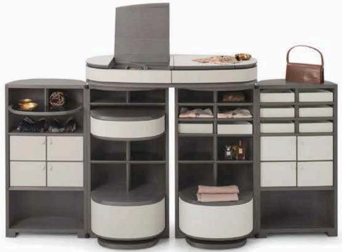
Giorgetti's Houdini is 'a piece that defies all classification. It is not a sideboard, it is not a storage unit, it is not a bar cabinet: it is a bit of all those things,' according to designer Roberto Lazzeroni. Visit: www.giorgetti.eu