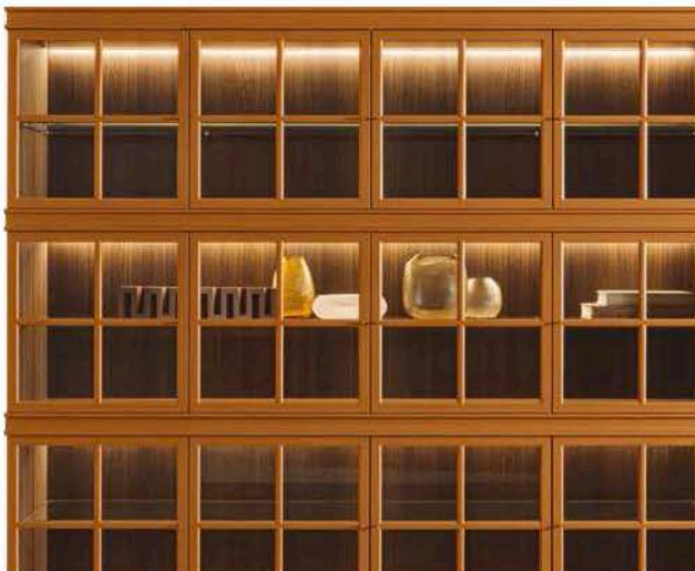
30 years after its introduction, Molteni&C added a spice lacquer version of Piroascafo, with eucalyptus interiors. Visit: www.moltenigroup.com