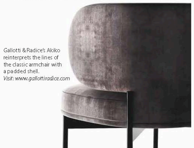
Gallotti & Radice's Akiko reinterprets the lines of the classic armchair with a padded shell. Visit: www.gallottiradice.com